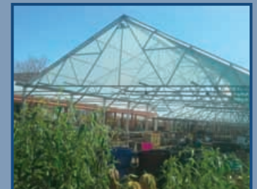
Greenhouse - Exterior View