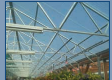
Greenhouse - Interior View