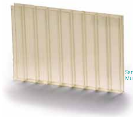
Sample 3 \Delta Y_i = 10 Typical Multiwall PC sheet warranty