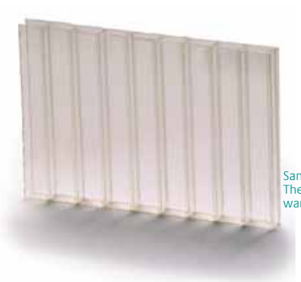
Sample 2 \Delta Y_i = 2 Lexan* Thermoclear* Plus sheet warranty