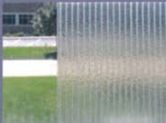
CoverLite® 6mm panel offers