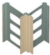
3 pc Corner (inside assembled)

The 3-piece corner makes installing a corner simple. It allows for easy fitment and access to all rebar. The design was created to resolve installer and inspector's worst nightmare.