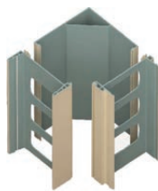
3 pc Corner (apart)