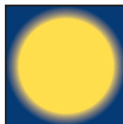
Direct Light 1% Diffusion