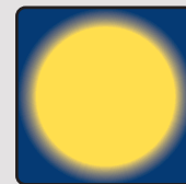
Direct Light 1% Diffusion

Protect Your Plants Grow Your Investment!